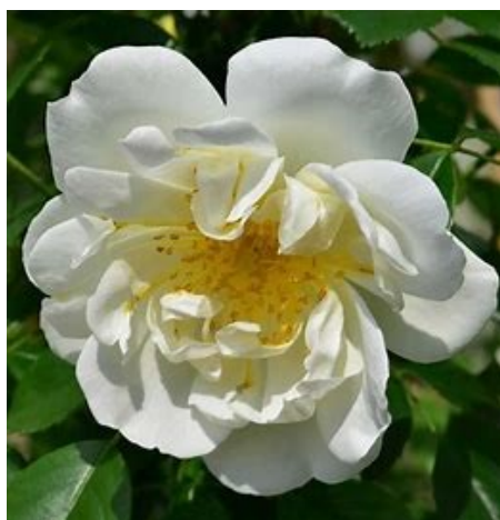
City of York

The Seven Sisters & Rosa Multiflora platyphylla. Purple Skyliner (2002) Repeat flowering and grows to 8', so not too big. Rambling Rosie (2006) Repeat flowering, grows to 20 -25', so needs plenty of room, unless it is cut back regularly. Little Rambler(1994) Very good and a smaller rose. Ghislaine de Feligonde (1916) Very good on north or west wall. Open Arms – small with a second flush of flowers.