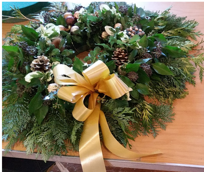
A finished article heading for a front door!