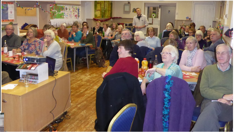
A picture of concentration!