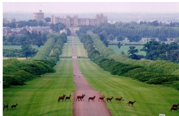
The Long Walk & Deer Park