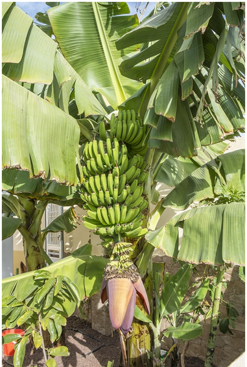
Banana Plant ( Musa )