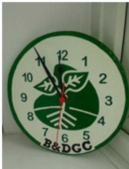
Carrot quiz— A & C