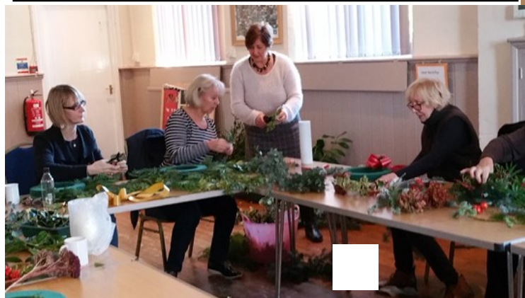
Hard at work!