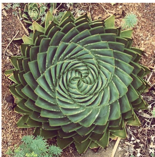
Fibonacci in a succulent—the spirals go in different directions for maximum sunlight