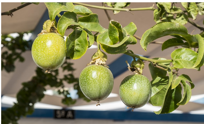
Passion Fruit ( Passiflora edulus )