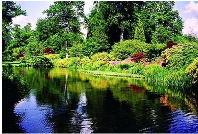
The Savill Gardens

So what are you waiting for? Go online, check out the detail and book now.