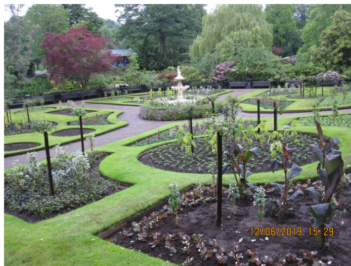
Photos of the Dingle Gardens