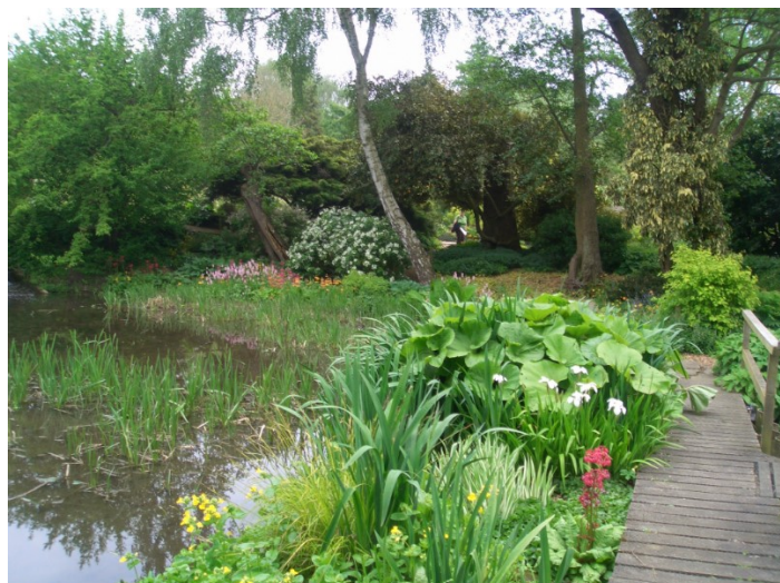
Garden at Moat House