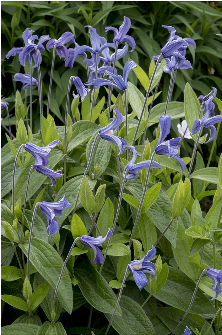
Herbaceous clematis intergrifolia