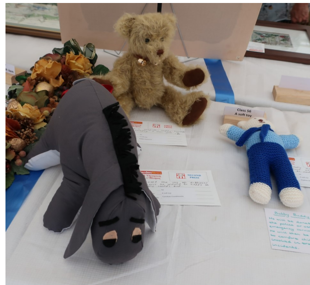
Eyore looks a bit sad cos he only came second!