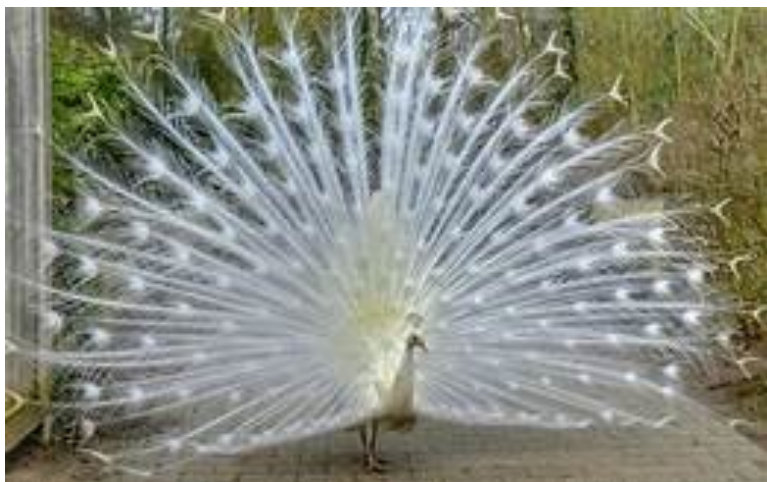
The stunning peacocks roam the gardens

The Knot garden was designed by Sylvia Platt, author of 'The Medieval Garden' and symbolises the Universe with 25 beds representing 25 civilisations.