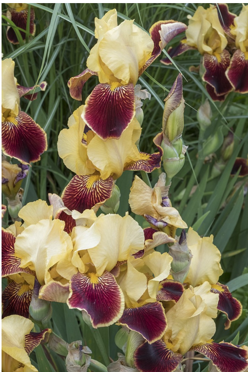
Moat House—Iris 'Rajah'