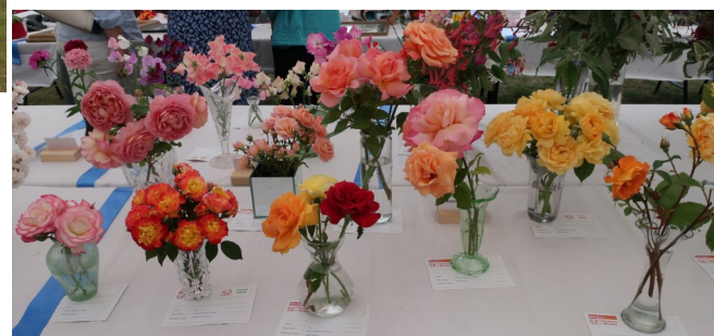
The roses looked particularly good this year